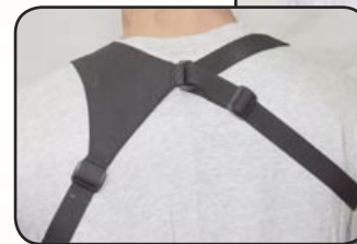
Now comes stock with a single cartridge carrier. Shown is the non-cartridge version