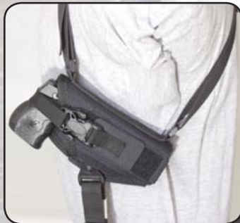
Shoulder - $79.95