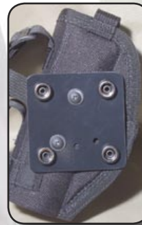
Single direction pull snaps are used on the snap & velcro version.

Item #2500-**** Special Item #'s Used Price - $79.95 * Other Colors Available *