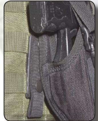
Straps tuck neatly out of the way when affixed to the vest or a belt.