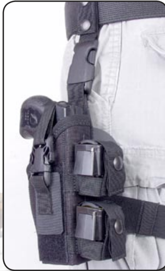
Thigh Rig - $79.95