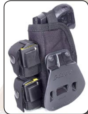
Paddle - $79.95