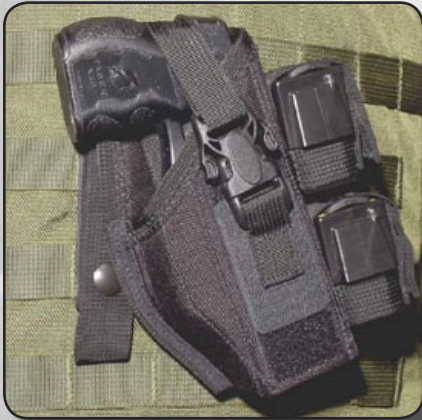
Military MOLLE/PAL modular webbing version

Our vest mounted systems are configured to work with all industry standard modular vest systems on the market today. The base is our standard dual cartridge holster with different backers. A special heavy duty Kydex backer plate allows for up to 22 degrees of fixed rotation providing an easier cross-draw. Choose from Military MOLLE/PAL, 2" on center snap and Velcro or the two inch webbing modular vest similar to the BTS system. All are designed for easy on/off applications. The Military MOLLE/PAL and BTS versions can also be adapted to be used on a belt if needed. If your agency purchases a different style vest all you have to change is the backer plate to the appropriate version for the new style vest. Please contact us if you need a custom vest version not listed here.