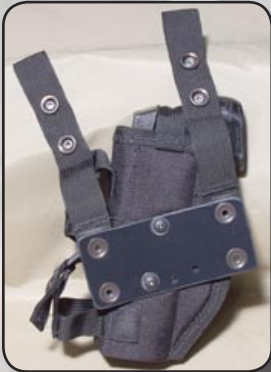
Removable modular webbing backer version allows for rapid on/off of the holster.