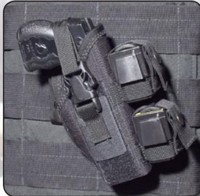
Two inch (BTS) modular webbing version.

Item #2500-**** Special Item #'s Used Price - $79.95 * Other Colors Available *