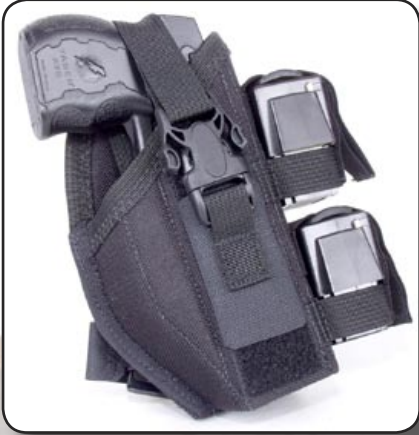
Belt - $74.95