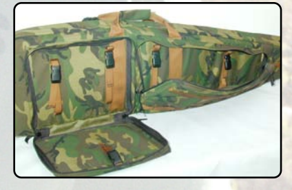
Padded pockets with 3/4" quick release buckles help to secure and protect sensitive gear.